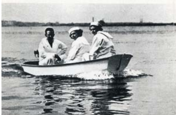
Above: Note how smoothly it travels under power