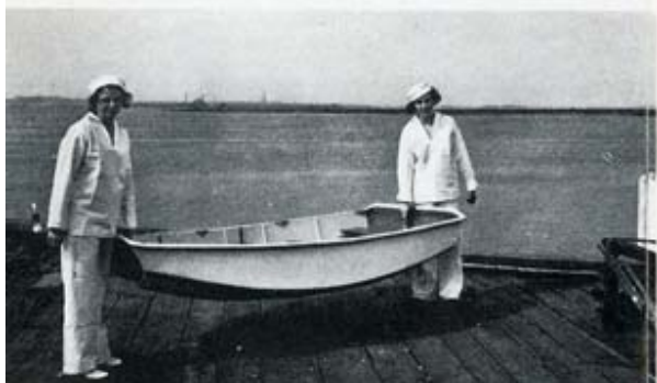
Below: The Lawley Pram weighs only 68 lbs.