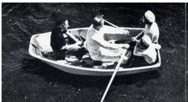
Holds four comfortably and rows easily