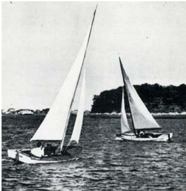
Beating to windward