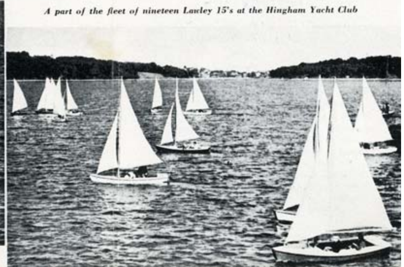
A part of the fleet of nineteen Lawley 15's at the Hingham Yacht Club