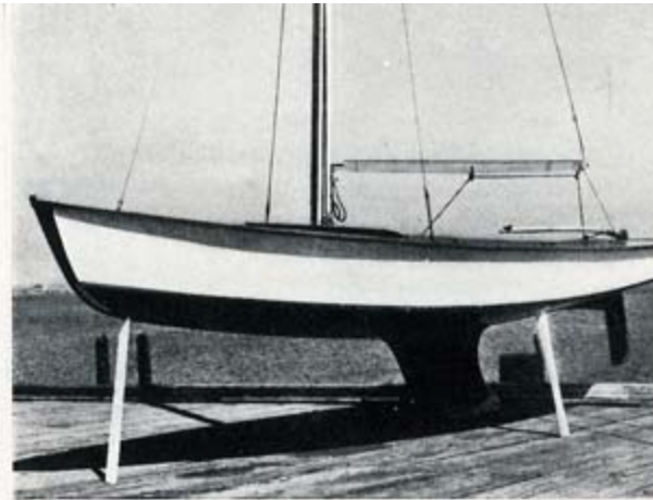
The clean lines make for speed, the generous free-board and beam for seaworthiness — Keel model

Note the roomy cockpit, the ample deck space and the rounded bow.