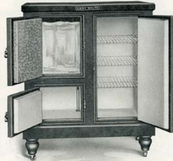
Style of Nos. 515 and 516

EDDY REFRIGERATORS CAN ALSO BE USED FOR ELECTRICAL REFRIGERATION