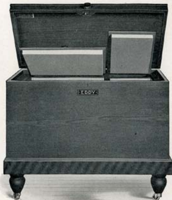
Style of Nos. 14 and 15