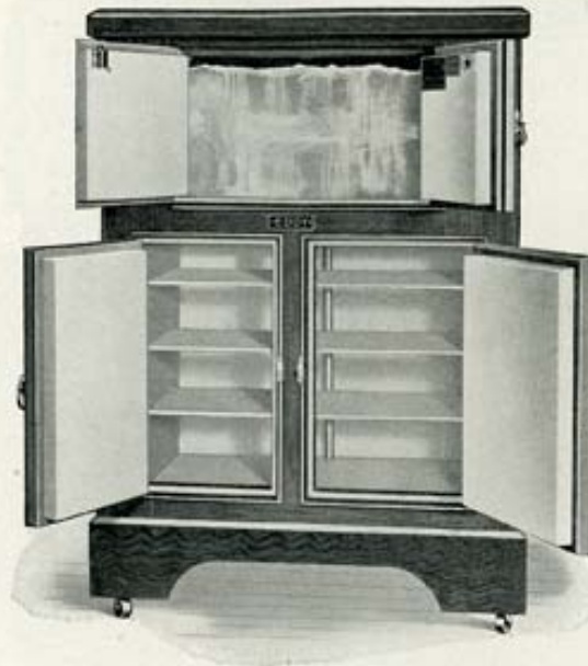
Style of No. 52