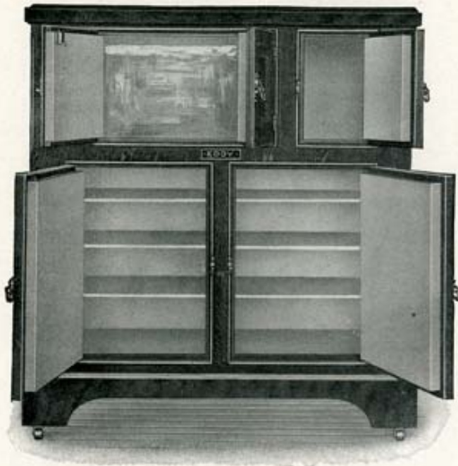
Style of No. 55