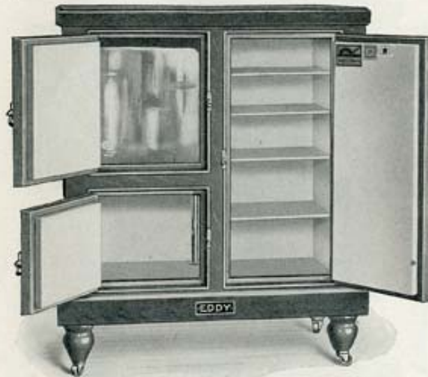
Style of Nos. 32, 33, 34, 35 and 36