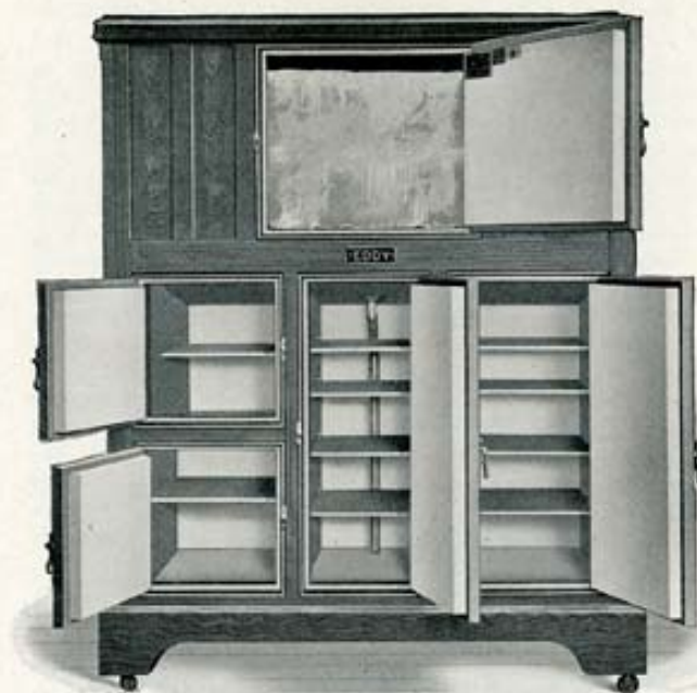
Style of No. 85