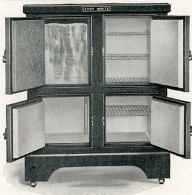
Style of Nos. 517, 518 and 520