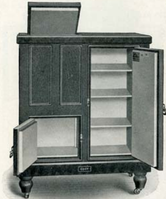
Style of No. 26