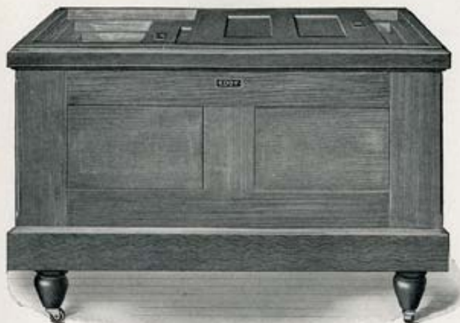
Style of Nos. 19, 20 and 21