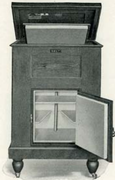
Style of Nos. 43 and 44