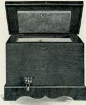
Style of No. 11