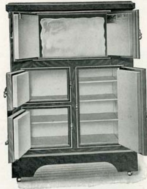
Style of Nos. 57 and 59