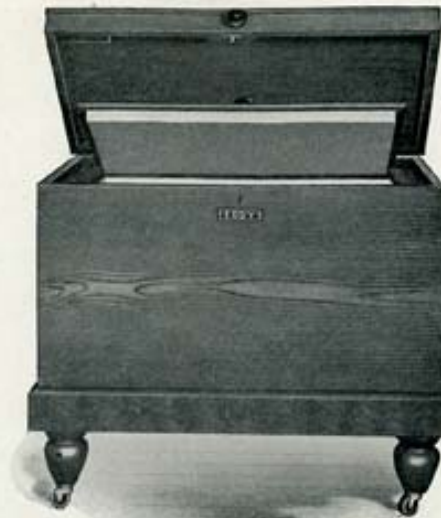
Style of Nos. 1 to 9, inclusive