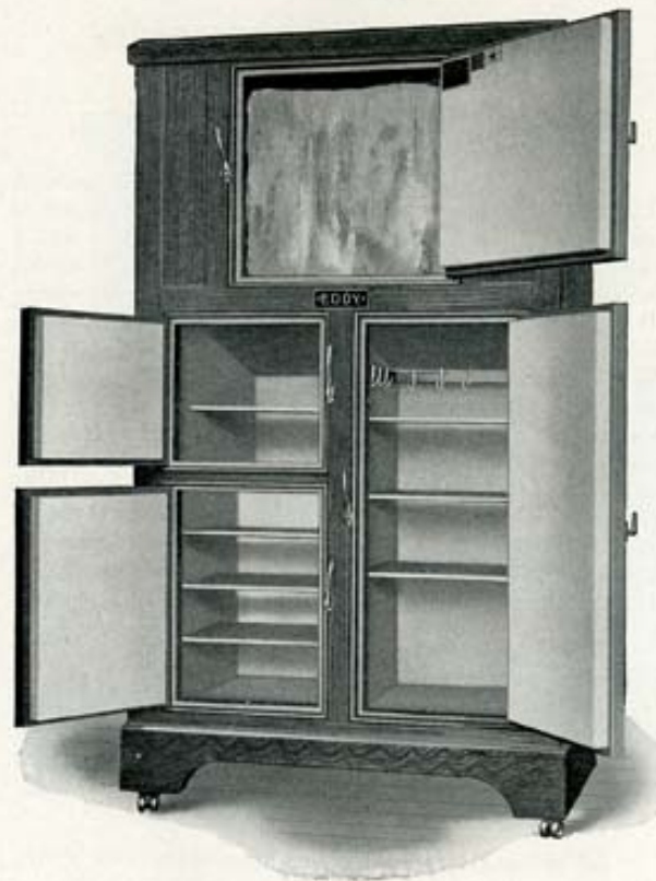
Style of No. 84