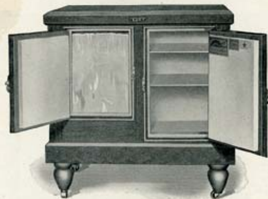
Style of No. 30