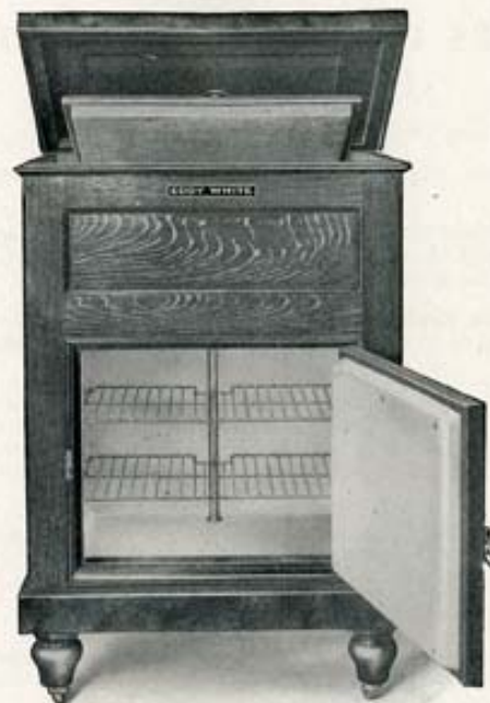
Style of No. 554