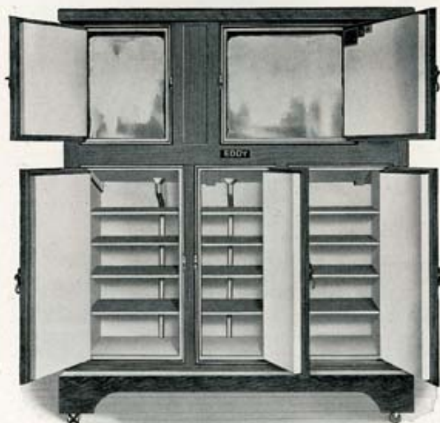
Style of No. 87