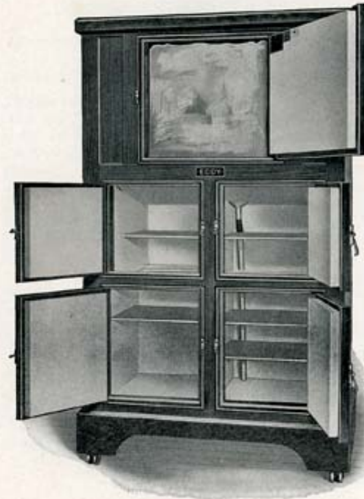
Style of No. 83