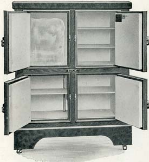
Style of Nos. 37, 38 and 39